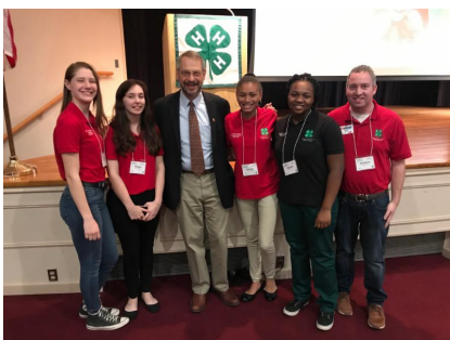
Meeting with Keynote Speaker Dr. Boris Lushniak, former Surgeon General of the United States (2013-2014)