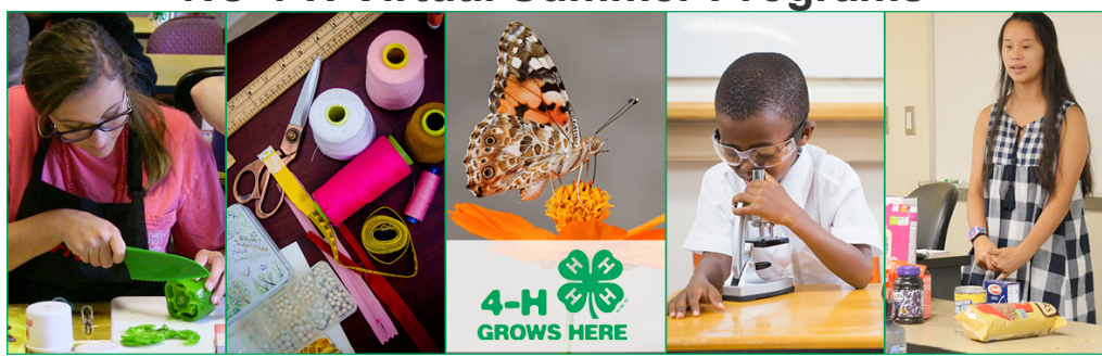
Keep your youth engaged all summer long!

Click on the individual title for more information.