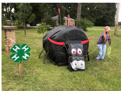
A submission from the Everhart Family of the Orange-Durham 4-H Livestock Club